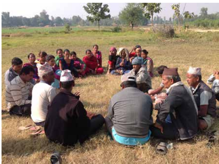
A citizens' forum in Banke district, Nepal, discussing how to protect children in the district

Such systems consist of various organisations and individuals (the particular combination varies from place to place): the social-welfare department, special units of the police force, the judiciary, school counsellors and specially trained teachers, doctors and nurses, help-lines that girls (or their friends and neighbours) can call, and specialist organisations, often NGOs, that provide legal and psychosocial assistance.